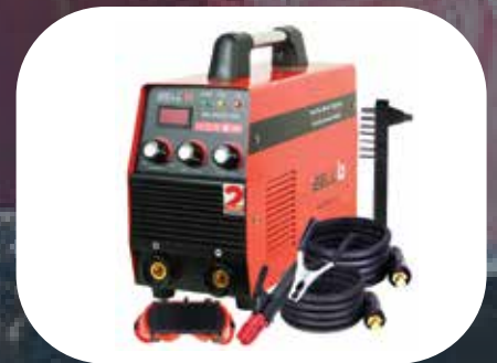
Arc welding machine (3 Pcs)