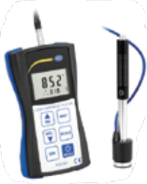
Hardness testing machine