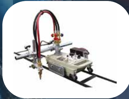
Gas cutting machine (16 mm Thk.)