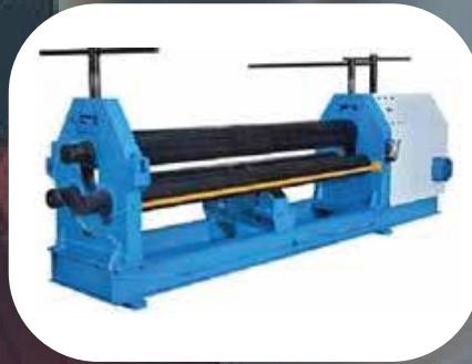
Rolling machine (16 mm Thk.)