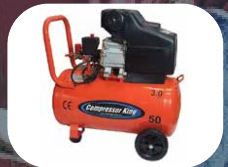
Air compressor 2Pcs