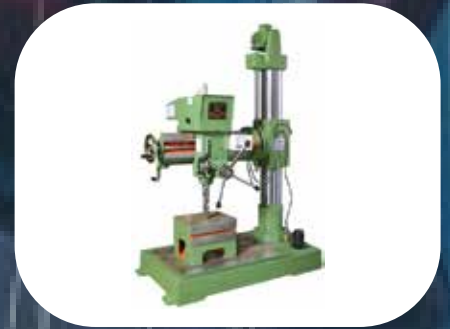
Radial Drilling Machine (13 mm Cap.)