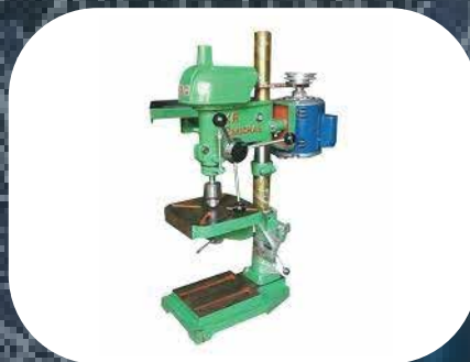
Manual Bench Type Pillar Drilling (13 mm)