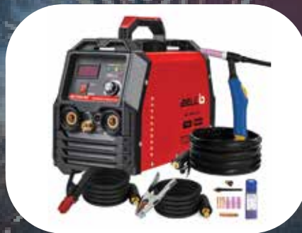
Argon welding set (2 Pcs)