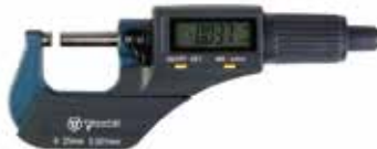
Digital Vernier caliper