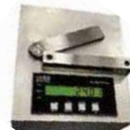
Angle Measurement machine