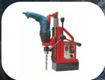
MAGNETIC DRILL MACHINE (13 mm)