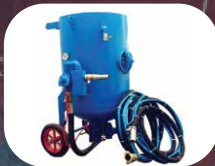
Sand blasting equipments