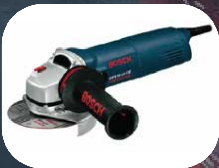
Grinding machines (15 pcs)