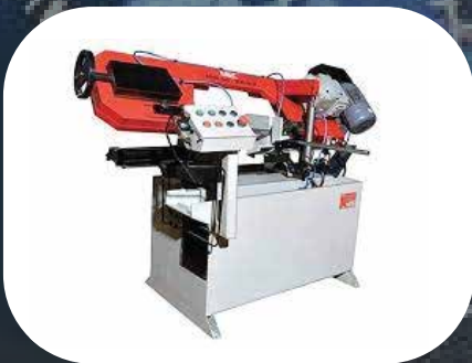
Swing cut machine