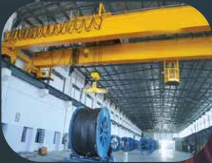
EOT crane (2 EOT crane capacity 10-15 ton, 1 gantry crane 8 ton)