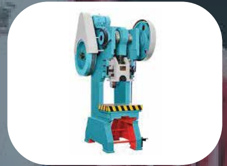
Press machine (2 Pcs and capacity-300 TON , 20 TON ,5 Ton)